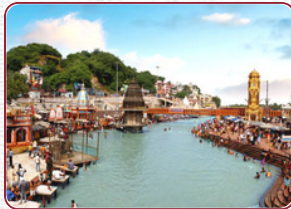
HAR KI PURI

Spend the day exploring the spiritual city of Haridwar, visiting famous attractions such as Har Ki Pauri, Chandi Devi Temple, Mansa Devi Temple, and Daksh Mahadev Temple. In the morning, start with a holy dip (Ganga Snana) in the sacred River Ganges. Explore the city through a local auto-rickshaw tour. In the evening, attend the mesmerizing Ganga Aarti at Har Ki Pauri.