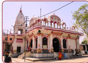
DAKSH MAHADEV TEMPLE