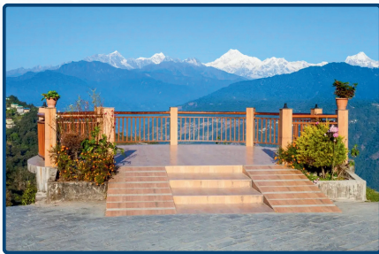
Tashi View Point

After breakfast at the Gangtok's hotel. Today you will be taking a day tour to Gangtok's city. You will be covering the Ganesh Tok, Tashi View Point, Handicraft, Flower Show, Ropeway, Tibet logy, Chorten Stupa, and Banjhakri Water Falls. By evening you will be escort back to hotel and have some rest.