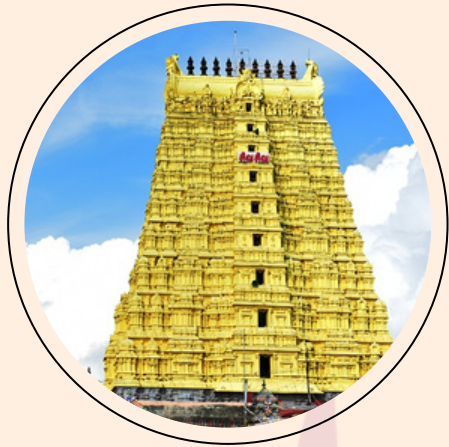
DAY 6 : Rameshwaram to Madurai

Rameshwaram Temple Darshan, Danushkodi Temple, Travel to Madurai, Evening Halt