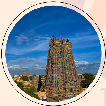
DAY 7 : Madurai to Bangalore/Hubli

After visiting Madurai Temple, we'll depart by train to Bangalore on the 11022 Dadar Central Chalukya Express, scheduled to leave at 17:55 hrs. We'll arrive in Bangalore the next morning at 04:15 hrs.