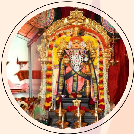
DAY 1: Arrival and Guruvayoor Darshan

Early morning at 12-30 am pick up from Thrissur Railway station, after pick up transfer to Guruvayoor Freshen up hotel- after freshen up Main Guruvayoor temple darshan, Elephant camp, Athirapally Waterfalls & night stay Munnar