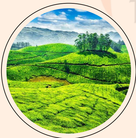
DAY 2: Munnar Adventure and Travel to Cochin

Early morning at 12-30 am pick up from Thrissur Railway station, after pick up transfer to Guruvayoor Freshen up hotel- after freshen up Main Guruvayoor temple darshan, Elephant camp, Athirapally Waterfalls & night stay Munnar