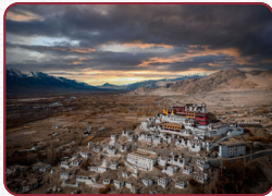
EAST INDUS VALLEY