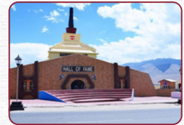
HALL OF FAME